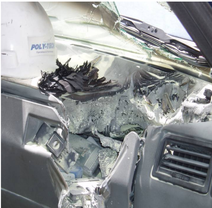
Figure 5: Evidence of rupture and heavy melting due to intense temperature as a consequence of the explosion