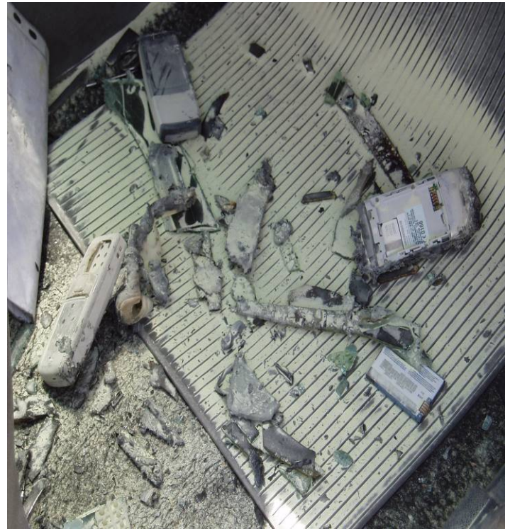
Figure 2: Remains of phone gadget