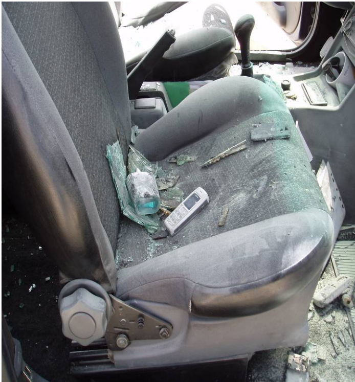
Figure 3: Effects of the explosion