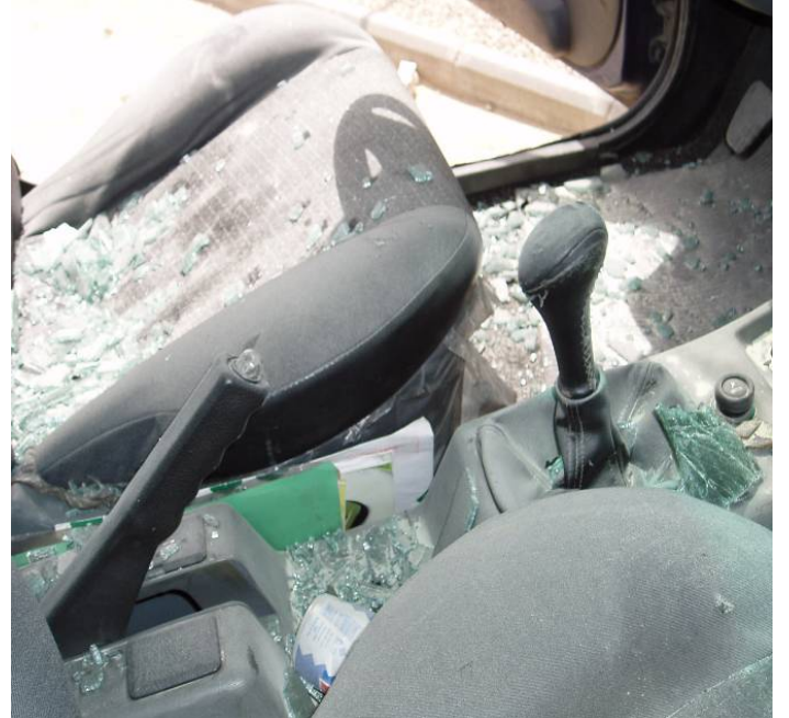
Figure 6: Car compartment damages and mobile phone units were destroyed beyond repair.